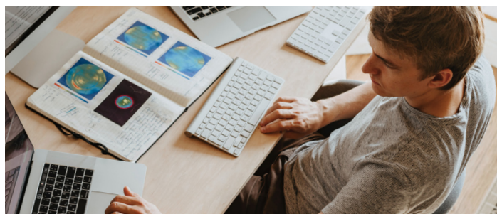
HR Compliance Library

Visit trustmineral.com for more information.