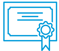
Certificates & Reporting